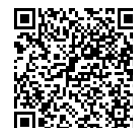
Tested By: Chris Farman Scientist Date: 06/18/2025

This product or substance has been tested by KCA Laboratories using validated testing methodologies and an ISO/IEC 17025:2017 accredited quality system. Values reported relate only to the product or substance tested. The reported result is based on a sample weight. Unless otherwise stated, results of tests performed on all quality control samples met criteria for acceptance established by KCA Laboratories. KCA Laboratories makes no claims as to the efficacy, safety or other risks associated with any detected or non-detected amounts of any substances reported herein. This Certificate of Analysis shall not be reproduced except in full, without the written approval of KCA Laboratories. KCA Laboratories can provide measurement uncertainty upon request.